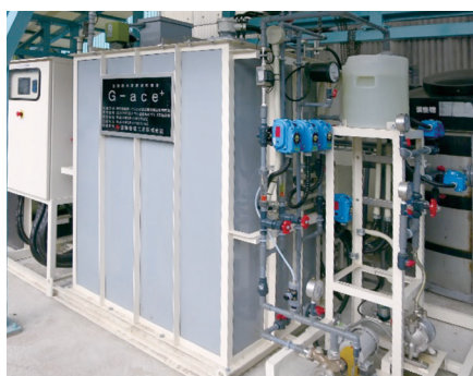
Motor cleaning waste (1m3/day)