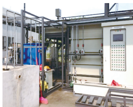
Compressor drainage (2m3/day)