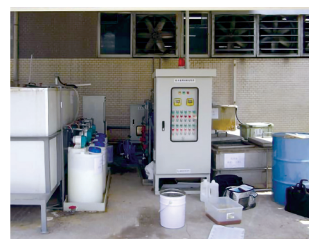
Mold washing waste (2m3/day)